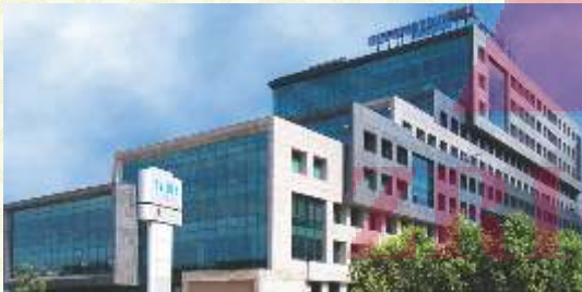
Time Tower, M.G. Road, Gurgaon