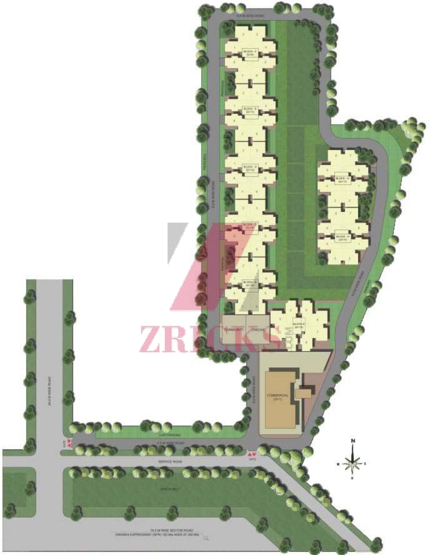
SITE LAYOUT PLAN