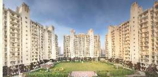
Essel Tower, M.G. Road, Gurgaon