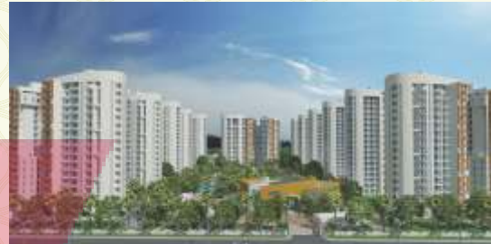
Parikrama, Sector-20, Panchkula