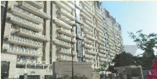
La Lagune, Golf Course Road, Gurgaon