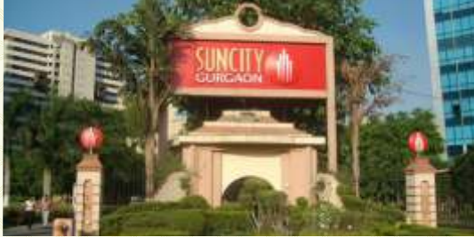
Suncity Township, Golf Course Road, Gurgaon