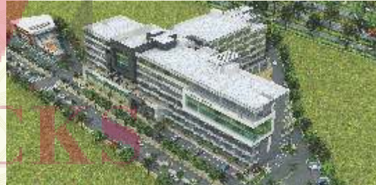
Success Tower, Sector-65, Gurgaon

Suncity Projects is one of the most eminent real estate companies in North India. The Group has built an unshakable reputation for quality, efficiency, trust and meticulous planning. Suncity Projects in North India are famous for offering top quality amenities, superlative designs, timely completion, guaranteed possessions and handing over of projects ranging from Townships to Group Housing to Luxury Apartments. In Corporate & Retail space Suncity Projects offers Shopping Malls to Office Complexes. The organisation is backed with the unmatched experience and expertise of two of India's most reputed business conglomerates - The Essel Group and the Action Group.